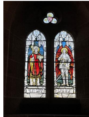
Waters Upton window, with